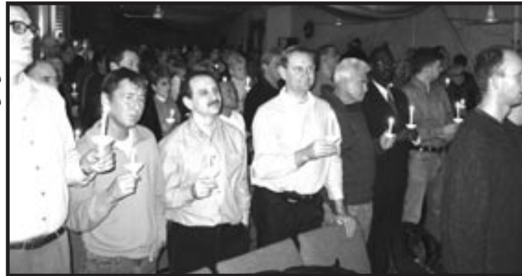
Christmas