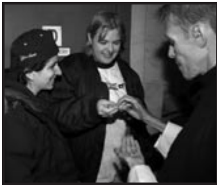
Civil Disobedience on behalf of Civil Rights: MCCNY takes over the NY City Clerk's chapel.