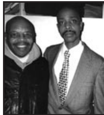
Congregants at coffee hour in the social hall after the Worship Service.