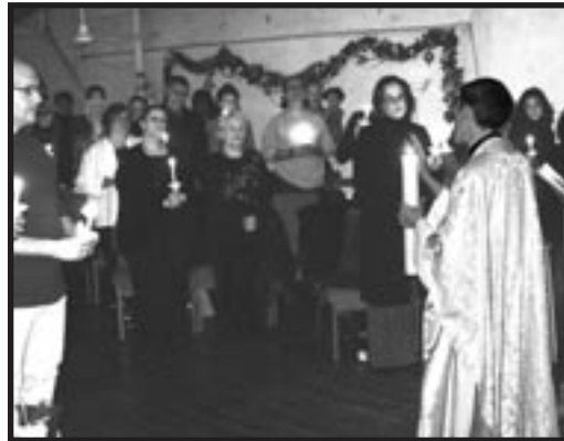
Christmas Eve congregation