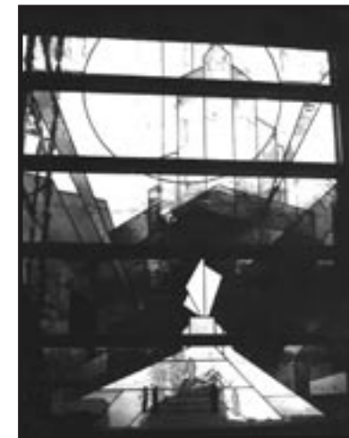
Seeing the light: Looking at the newly-installed brightly colorful stained glass windows from inside the sanctuary in January.