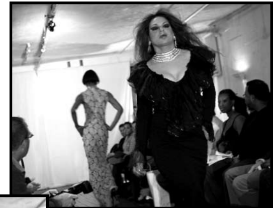
Models on the runway

Pantry and homeless queer youth shelter, both of which are named for the late legendary transgender activist and MCCNY member Saint Sylvia Rivera. It was the 3rd annual Fashion on Gender show and the best-attended yet, and received considerable publicity in mainstream publications from Time Out NY to the free daily Metro .