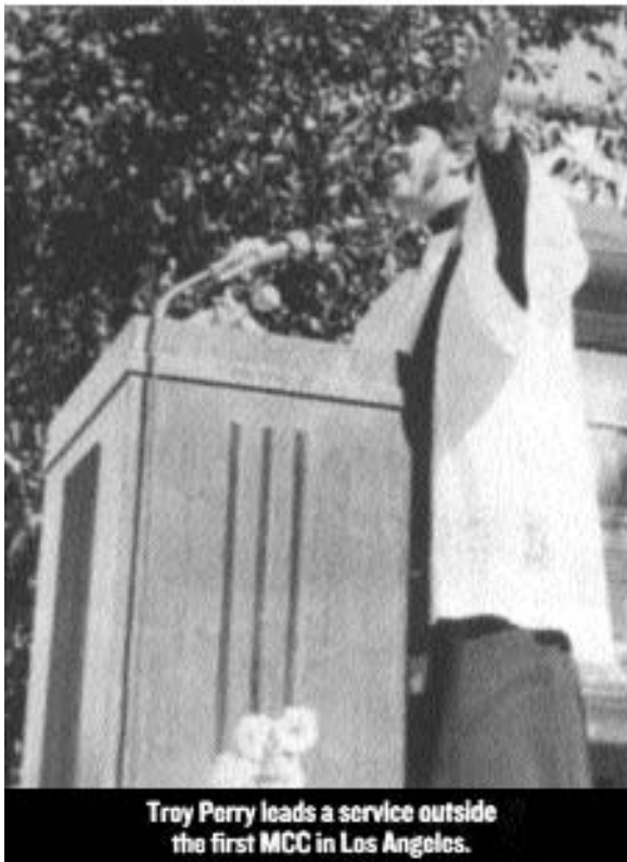
Troy Perry leads a service outside the first MCC in Los Angeles.

The Advocate national newsmagazine notes the 34th anniversary of the founding of the MCC denomination.