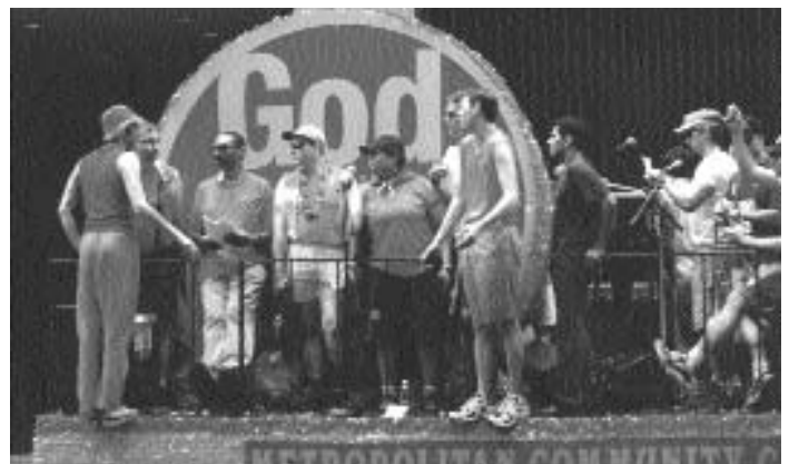
MCCNY's 2002 Pride float: nominated for "Best Sound".