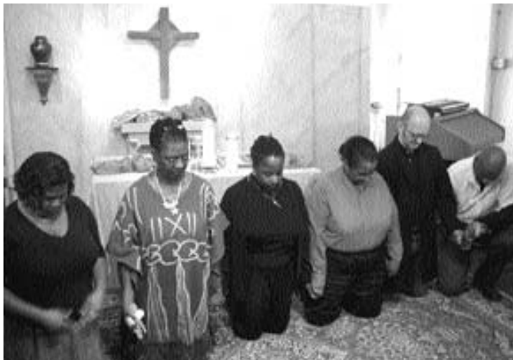
Some of the new deacons praying as they are commissioned.