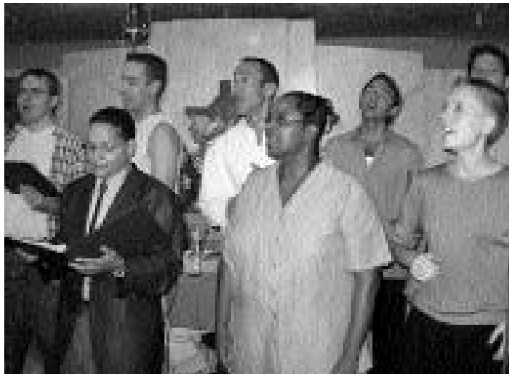
Part of the morning choir on Homecoming Sunday.

Tues., March 11th, Lenten Bible Study begins (classes are held at many convenient times throughout the week, at the church and other locations).